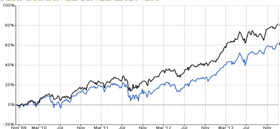
■ A - Wise Investments - Evenlode Income B Inc TR in GB [81.48%] ■ B - IMA UK Equity Income TR in GB [61.81%]

19/10/2009 - 02/01/2014 Data from FE 2014